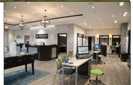
The new Owosso location of Advanced Eye Care (above) opened one year ago on June 17, 2017