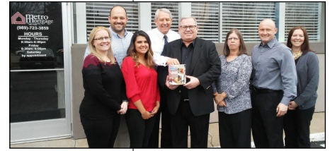
The Staff at Metro Mortgage drew a lucky Chamber Raffle Winner on March 28!